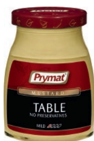
Table mustard mild

net weight : 185 g no. of items in a collective packaging : 9 pcs. no. of items on a pallet : 2 376 pcs. shelf life : 12 months language version : pl/en