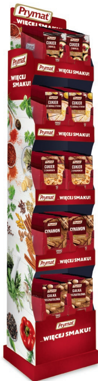
Prymat display stand P-15 cardboard